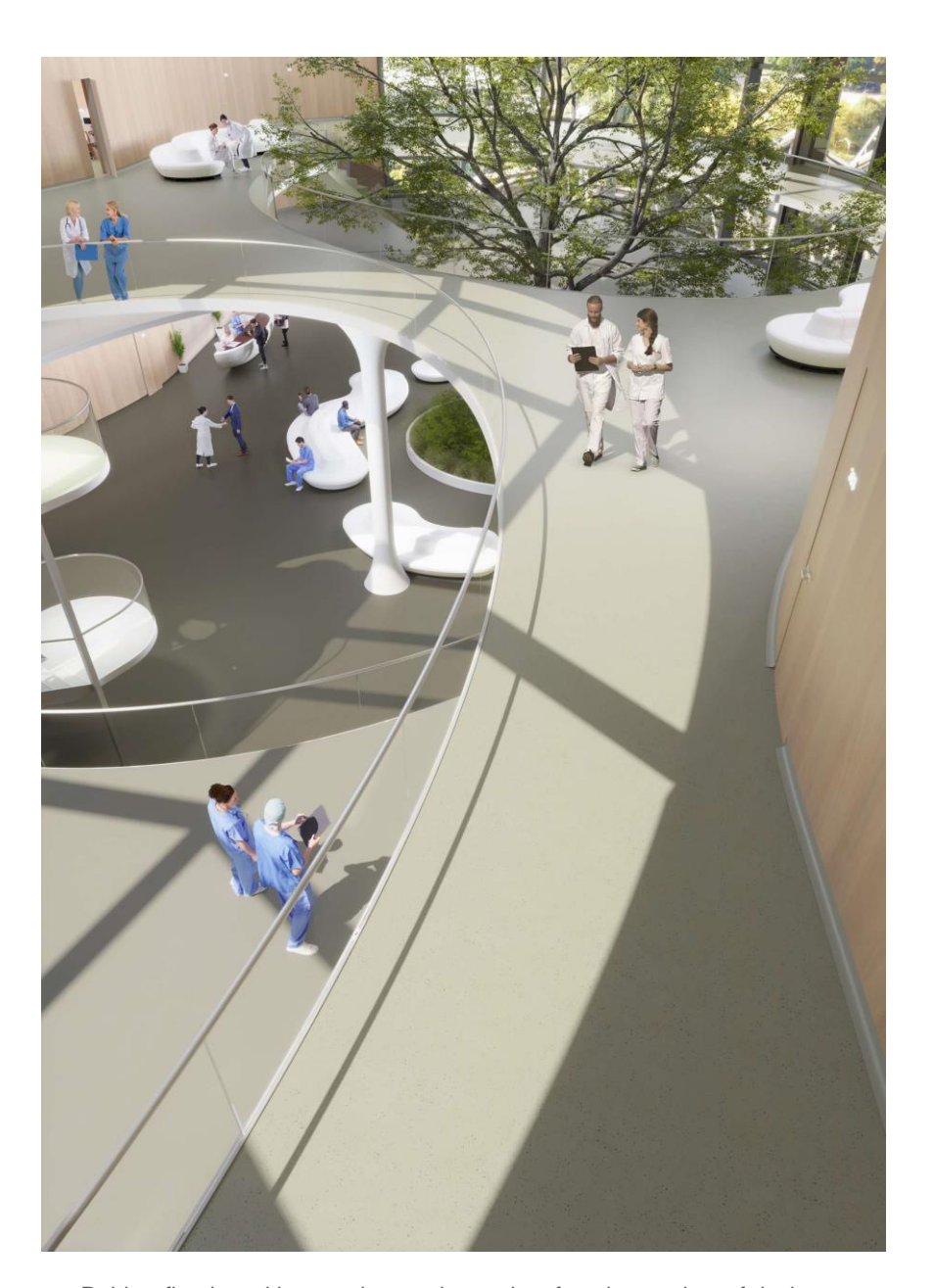
Rubber flooring with smooth or embossed surface in a variety of designs.

RUBBER FLOORING TECHNOLOGY RESILIENT FLOOR COVERING