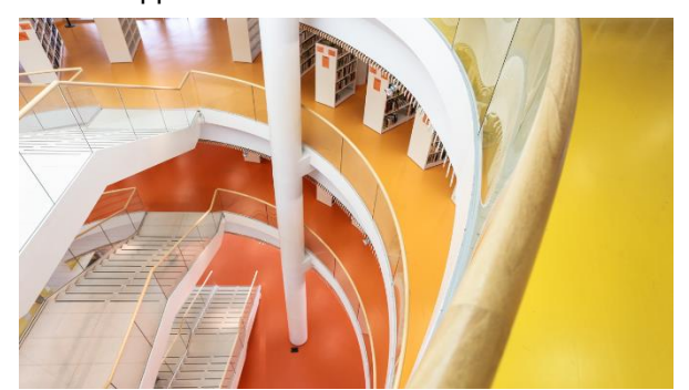
Figure 3 Example of application.

The products covered by this declaration are designed for use in schools, offices, laboratories, hospitals, museums, indoor public spaces and other commercial environments. Artigo rubber flooring is classified in accordance with ISO 10874 (previously EN 685) and in reference to the FCSS (Floor Covering Standard Symbol) to be installed in the following areas of application: